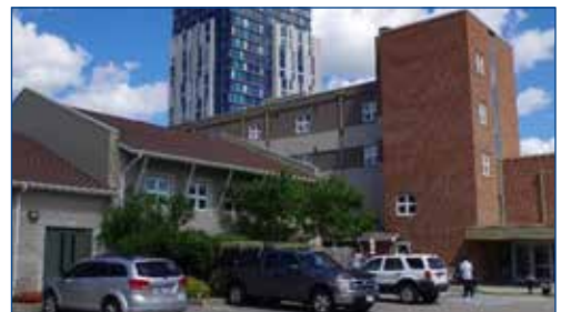
Richard and Joan Brown Home - 54 Beds Resident Profile: Mixed Population

This program is for New Leaf graduates age 50 years and older in need of assisted living. The program provided housing to 24 men this past year. Prior to the implementation of new programs, a renovated dining area and workout facility many of these clients lived in isolation from each other. Today, the new changes have brought about a greater sense of community as demonstrated by a significant increase in social interaction between clients and their involvement in agency activities.