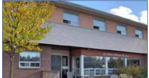
Sir Robert Williams House - 33 Beds Resident Profile: Federal Parolees

SLPP Operates a 75 bed Community Residential Facility program for men exiting the prison system. This past year 158 men began their reintegration back into society at SLPP. 6% were men living with severe mental health and/or complex medical conditions. Our supportive housing and wraparound resources provided each new arrival with a full orientation to the agency, a customized care plan centered on their safe reintegration back into society, as well as on site medical and psychiatric supports and daily access to capacity building programs.